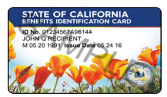
BIC "blue and white" Design